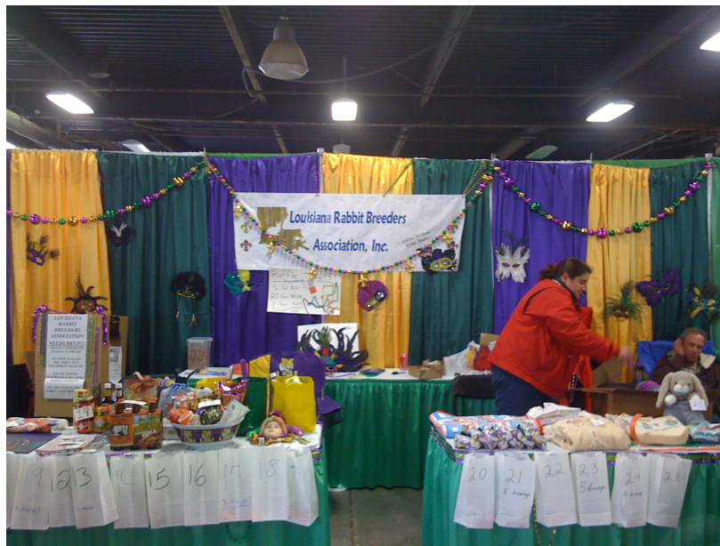
LRBA Booth at Convention in Kentucky